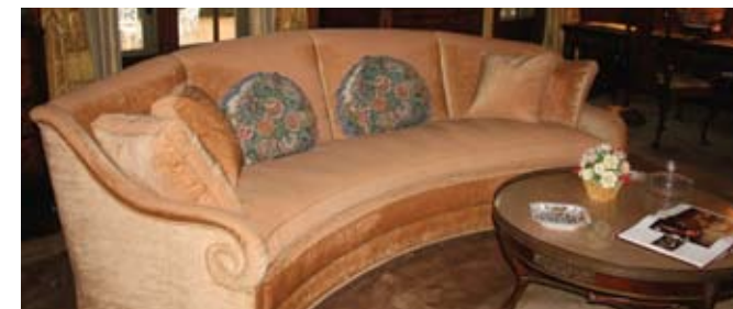
The design of the living room sofa was inspired by the curved stone bench in the gardens.