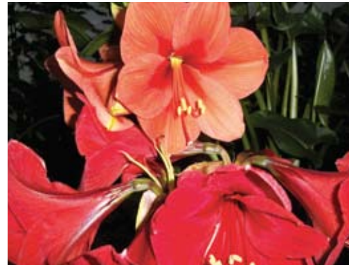
Amaryllis brighten the greenhouse on a cold winter day.

Maintenance of Amaryllis is simple. After each bloom fades it should be cut off to the stem. The stem should be cut back to the bulb after it yellows and sags. Continue to water and fertilize the leaves through the summer gradually reducing both. In late summer, discontinue watering and let the plant “rest” for a minimum of 6 to 8 weeks. The bulb may be stored in the soil in a dry place with cool temperatures. DO NOT let the bulb freeze!